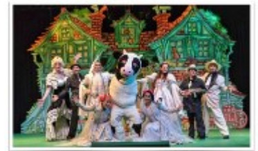
JACK AND THE BEANSTALK

Since we are unable to perform school shows this year, we are bringing the pantomime to the children in their own school. The Ulster Theatre Company will stream the pantomime “Jack” over two days of our choice, so the children can enjoy the experience even though the theatres cannot open.