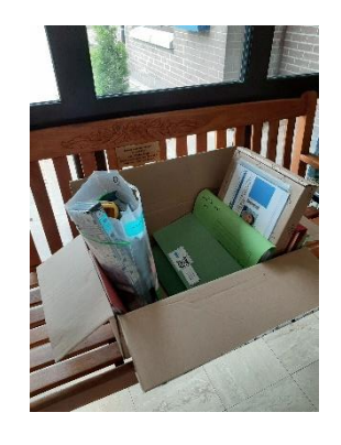
Home School packs to be collected