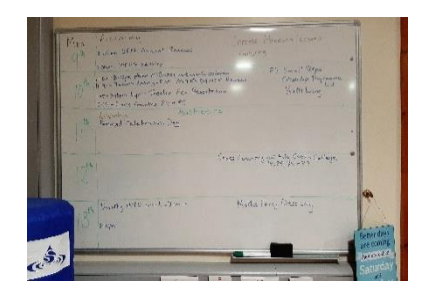
Final staff noticeboard of 2019/20. March 9<sup>th</sup> – 13<sup>th</sup>!