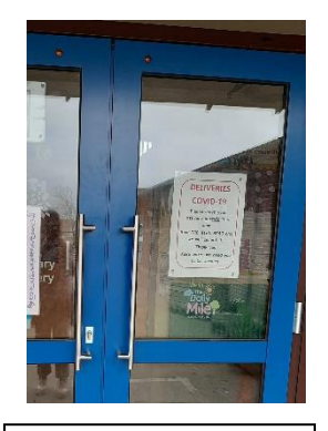
No Entry for Deliveries