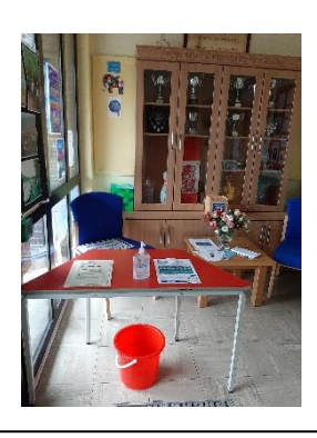
Makeshift Sanitising stations