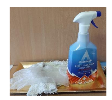
Bring Your Own Disinfectant