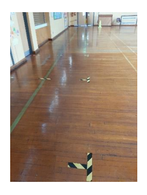
Assembly Hall with social distance marking for staff meeting