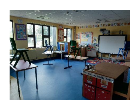
Classroom prepared for key workers' children